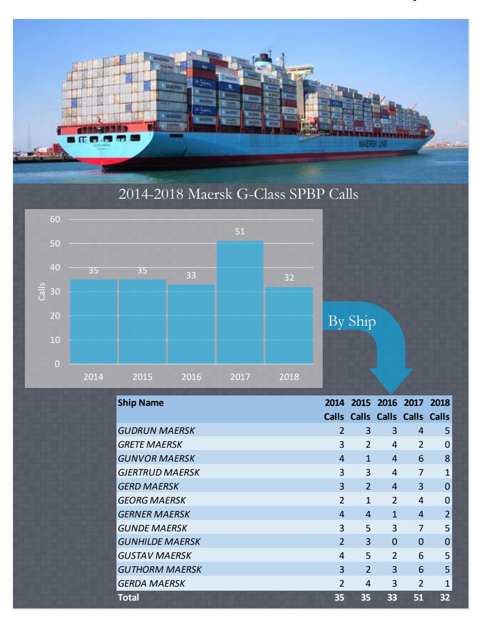
Table 1.1: Maersk G-Class Vessel Calls to the San Pedro Bay Ports