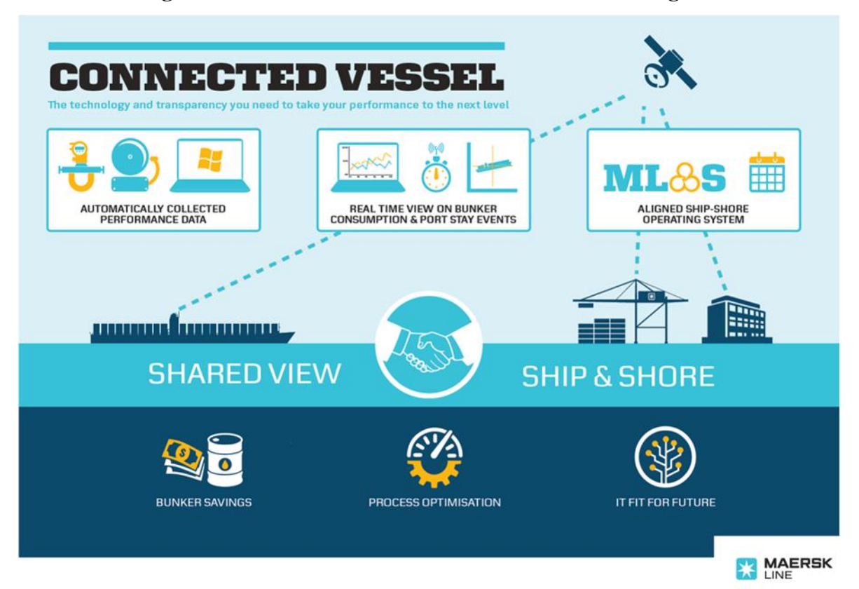
Figure 1.1: Overview of Maersk's Connected Vessel Program

In parallel with these efforts, Maersk also developed their Star Connect platform, which uploads the high-fidelity sensor data from each vessel to Maersk servers via satellite. Using this data, Maersk's Global Vessel Performance Centre (GVPC) can communicate with each vessel in real-time to increase operational efficiency. See Figure 1.1 for an overview of the program.